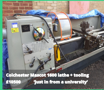
Colchester Mascot 1600 lathe + tooling just in from a university £10500