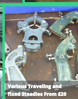
Various Traveling and fixed Steadies From £20