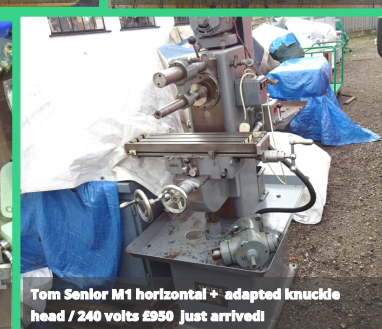
Tom Senior M1 horizontal + adapted knuckle head / 240 volts £950 just arrived!