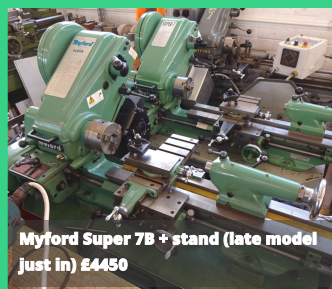
Myford Super 7B + stand (late model just in) £4450