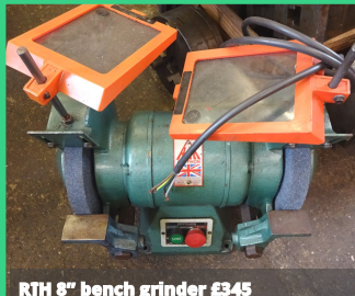
RJM 8" bench grinder £345