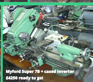
Myford Super 7B + cased inverter £4250 ready to go!