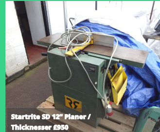
Startrite SD 12" Planer / Thicknesser £950