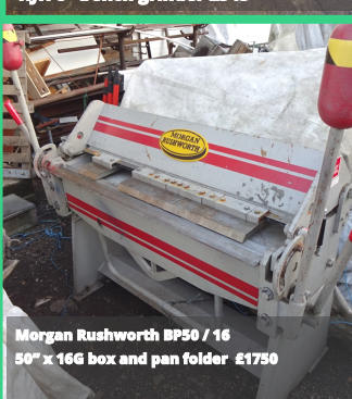
Morgan Rushworth BP50 / 16 50" x 16G box and pan folder £1750