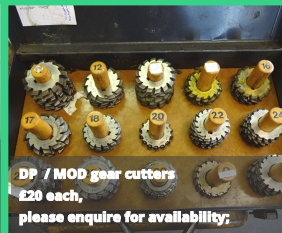
DP / MOD gear cutters £20 each, please enquire for availability;