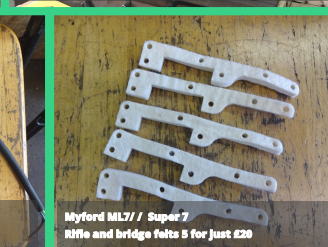
Myford ML7 / Super 7 Ribs and bridge bolts 5 for just £20