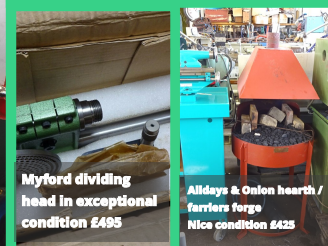
Myford dividing head in exceptional condition £495