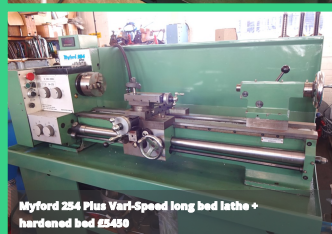
Myford 254 Plus Vari-Speed long bed lathe + hardened bed £3450