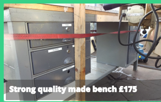
Strong quality made bench £175