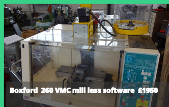
Boxford 260 VMC mill less software £1950