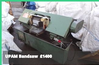
UPAM Bandsaw £1400