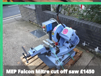
MEP Falcon Mitre cut off saw £1450