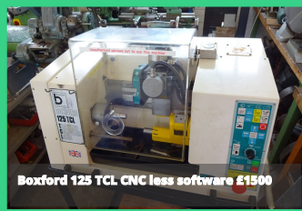
Boxford 125 TCL CNC less software £1500