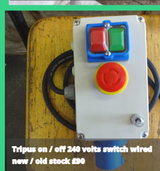
Tripus on / off 240 volts switch wired new / old stock £90