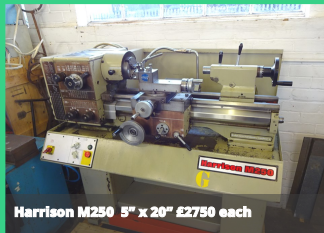
Harrison M250 5" x 20" £2750 each