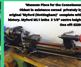
'Museum Piece for the Connoisseur' Oldest in existence owned privately by original 'Myford (Nottingham)' complete with history. Myford ML1 lathe 3 1/8" centre height One off £2250