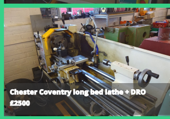
Chester Coventry long bed lathe + DRO £2500