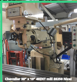
Chevallier 50" x 10" 40INT mill £6250 Nicel