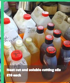
Neat cut and soluble cutting oils £10 each