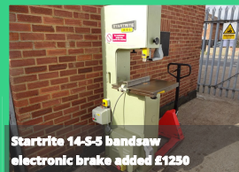
Startrite 14-S-5 bandsaw electronic brake added £1250