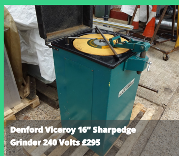
Denford Viceroy 16" Sharpedge Grinder 240 Volts £295

Please phone 0208 300 9070 to check availability. Distance no problem - Definitely worth a visit - prices exclusive of VAT Just a small selection of our current stock photographed!