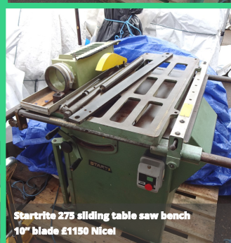
Startrite 275 sliding table saw bench 10" blade £1150 Nicel