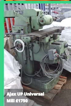
Ajax UP Universal Mill £1750