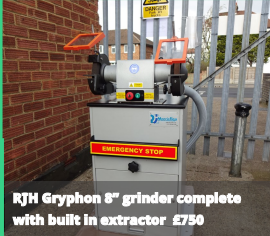
RJM Gryphon 8" grinder complete with built in extractor £750