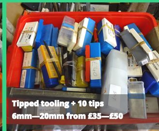
Tipped tooling + 10 tips 6mm—20mm from £35—£50