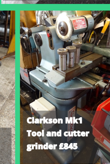
Clarkson Mk1 Tool and cutter grinder £845